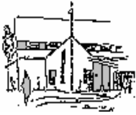
Sacred Heart Church Yeppoon Tabor Drive Lammermoor Beach