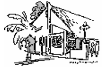
Mary Immaculate Church Emu Park Archer Street Emu Park