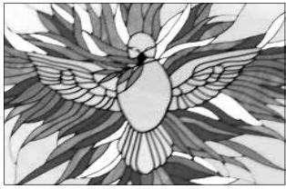
Sacred Heart Church Yeppoon