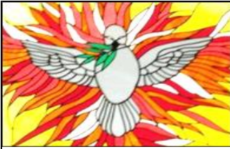
Sacred Heart Church YEPPOON