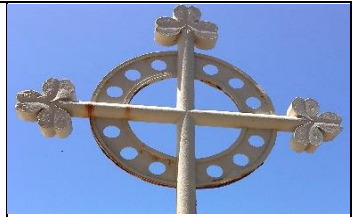
Mary Immaculate Church EMU PARK

Facebook: www.facebook.com/capricorncoastcatholicparish