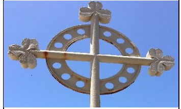
Mary Immaculate Church EMU PARK